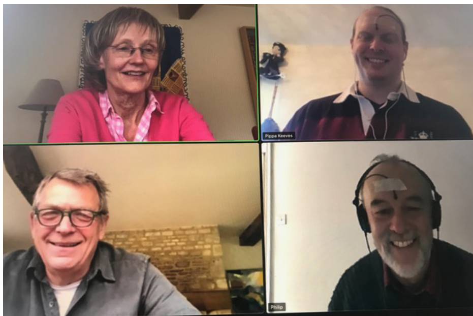
DOING THE ONLINE RECORDING FOR "FORBIDDEN MUSIC"