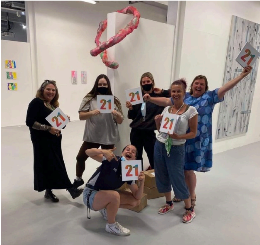
RECEIVING OUR CATALOGUES HOT OFF THE PRESS

Preparations began on 1st June, when the art students cleared, cleaned and completely redecorated what had previously been their studios. Next, all the show participants delivered work to the studio, where it was curated and installed. This whole process took around three