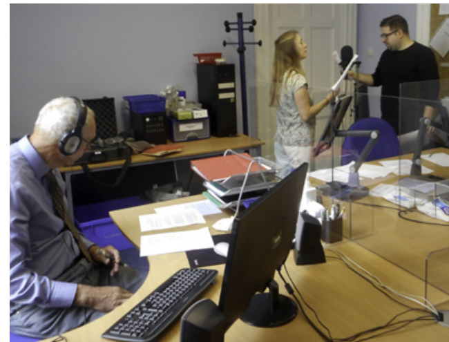
"FACE THE MUSIC" BEING RECORDED AT THE COTSWOLD LISTENER STUDIO