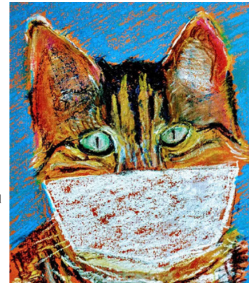
SIGNS OF THE TIMES BY MICK WALSH