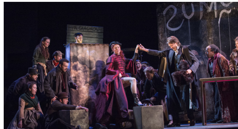
ENGLISH TOURING OPERA'S PRODUCTION OF LA BOHÈME, 2015

Opera is no longer an 'elite' entertainment and our members have the pleasure of going to the theatre with a large, social group of friends as well as regularly meeting for talks and opera screenings. Membership is £20 for individuals and £35 for couples. As soon as we are able to finalise dates the latest information will be available on our website.