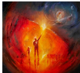
CHRISTIAN ARTS FESTIVAL, 23 APRIL - 12 MAY

Cleeve Chorale Spring Concert, Sat 6 Apr, 7.30pm,