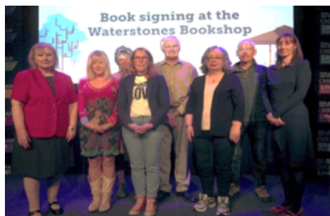
WINNERS, RUNNERS-UP AND JUDGES IN THE GWN 2018 COMPETITION

The annual competition is open to everyone aged 16 and over who lives, works or studies in Gloucestershire and South Gloucestershire. In 2018 GWN was pleased