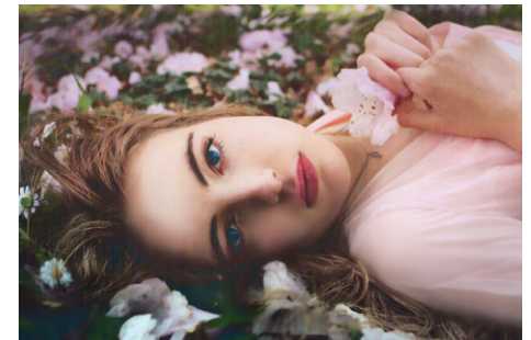
THE DREAM BY ABBIE RADA

The photographs illustrated are prizewinning photographs from the 2018 competition.