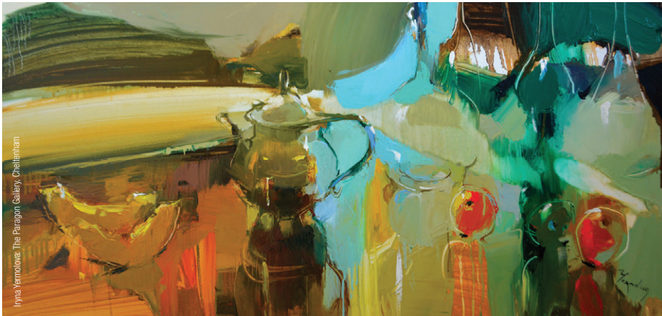
Irina Yermolova, The Paragon Gallery, Cheltenham

CONTEMPORARY ART FAIR CHELTENHAM RACECOURSE 26-28 APRIL 2019