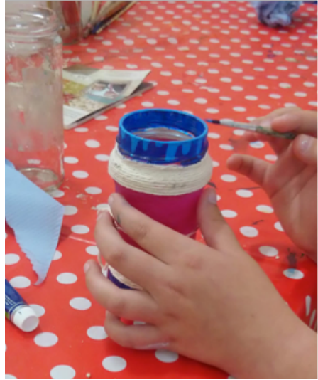
JOURNEYMAN CREATIVE COMMUNITY PROJECTS OVER THE SUMMER: UPCYCLING