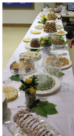
CHELTENHAM ITALIAN SOCIETY'S 50TH ANNIVERSARY REFRESHMENTS