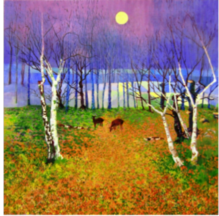
THE FOREST'S MUSIC, BY ANGELA SUMMERFIELD, OIL ON CANVAS

WDW has also been busy with its theatre producing arm, the Natura Contemporary Theatre, and in less than a year has produced The Tree Charter Tapestry for Canwood Gallery open air theatre, Herefordshire and An Honest Politician , for the 6th Stroud Theatre Festival. The Tree Charter Tapestry was inspired by