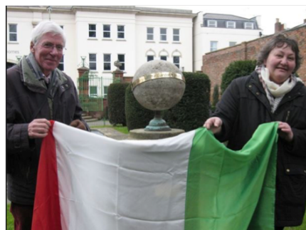
MEMORIAL GLOBE UNVEILED, THE ITALIAN GARDEN, FEBRUARY 2015

Details of tickets for the November talk and how to purchase the cookery book will also be available on the website.