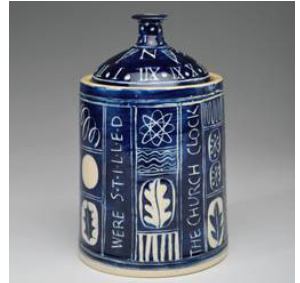
GUILD CRAFTS CHELTENHAM AT GARDENS GALLERY, 5T - 14 OCTOBER 2018, SEE LISTINGS

Perspectives is produced three times a year. The next issue will span February - May 2019.