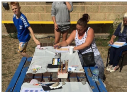
JOURNEYMAN CREATIVE COMMUNITY PROJECTS OVER THE SUMMER: MANDALA PAINTING

Over the summer we have been involved in several creative projects with the youngsters of our area, working with St Peters and the Moors Big Local , Cheltenham Borough Homes, The Rock and Tesco to deliver fun creative sessions and an upcycling project with a focus on arts and crafts. We have had conversations