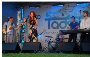
STUDIO 340 (PAGE 7) WILL BE AT THE TADSTOCK YOUTH MUSIC FESTIVAL, A FULLY SOLAR-POWERED FESTIVAL, TAKING PLACE OVER AUGUST BANK HOLIDAY (24/26 AUGUST)