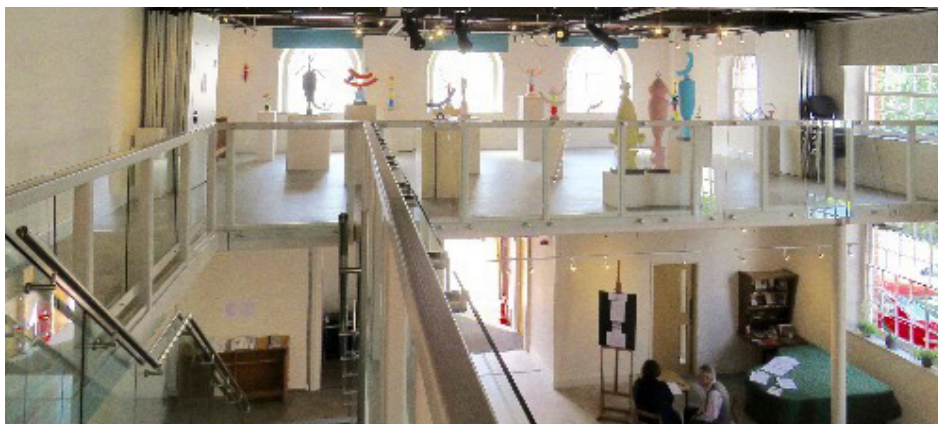
BRIGHT AIRY SETTING FOR CONTEMPORARY WORKS