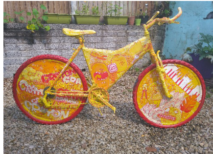
SHAMMY BY KID CRAYON