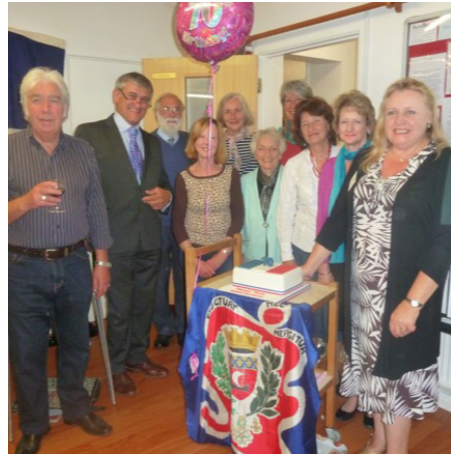
CELEBRATING IN STYLE

We generally meet on the first and third Monday evenings of the month at St Luke's hall in central Cheltenham.