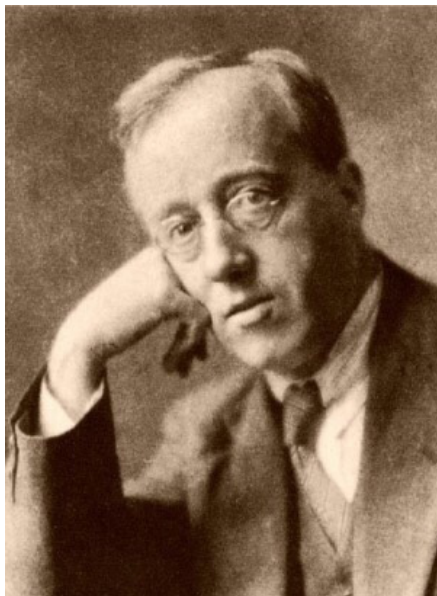
GUSTAV HOLST, BORN AT 4 PITTVILLE TERRACE IN 1874