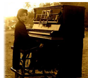
RIMSKI'S BICYCLE PIANO, PERFORMING AT CHELTHENHAM MUSIC FESTIVAL 2016