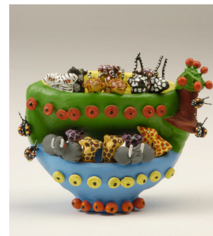
'NOAH'S ARK', CONCEPTION AGUILAR

– with activities being held daily at the museum. The programme will include storytelling, mask making, a group project for all visitors to take part in, museum trail, exhibition trail and activity sheets. Come and let your imagination run wild!