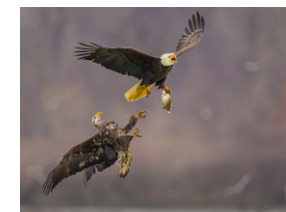
'CAN WE SHARE THE FISH', HUIZHONG CAI (USA), RPS GOLD WINNER – NATURE CATEGORY 3RD CHELTENHAM INTERNATIONAL SALON OF PHOTOGRAPHY

Cheltenham Cantilena Orchestra Charity Concert , Sun 25 Sept, 3pm, Town Hall, in aid of British Heart Foundation.