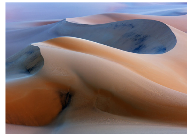
'DUNE BEFORE SUNRISE', STEPHAN FUERNROHR (GERMANY) PSA GOLD WINNER, COLOUR CATEGORY, 3RD CHELTEMHAM INTERNATIONAL SALON OF PHOTOGRAPHY

Cheltenham Poetry Society Workshop , Tue 6 Sept, 7–10pm, Parmoor House, Lypiatt Terr, info: Sharon Larkin 07540 329389.