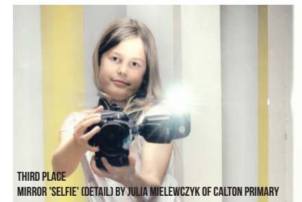
THIRD PLACE MIRROR 'SELFIE' (DETAIL) BY JULIA MIELEWCZYK OF CALTON PRIMARY