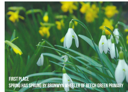
FIRST PLACE SPRING HAS SPRUNG BY BRONWYN WHEELER OF BEECH GREEN PRIMARY