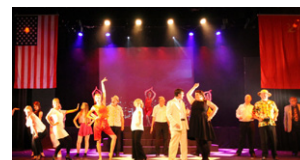
"ONE NIGHT IN BANGKOK" FROM CHES BY PROMENADE PRODUCTIONS (SEE P.4)