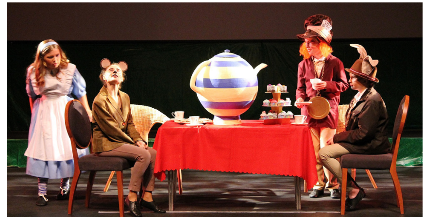
MAD HATTER'S TEA PARTY FROM ALICE: THE MUSICAL BY YOUNG PROMENADERS

These are all essential to making a show successful. And of course, friends, family and the interested public buying tickets – this is the best way to ensure that Promenade Productions continues to thrive.