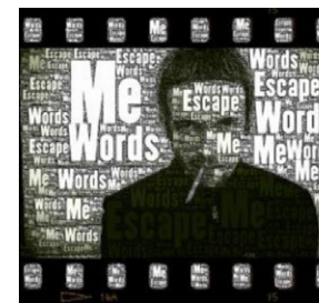
WORDS ESCAPE ME AT THE POETRY FESTIVAL

Cheltenham Italian Society: A digital tour of Rome , Mon 14 Mar, 7 for 7.30pm, Parmoor