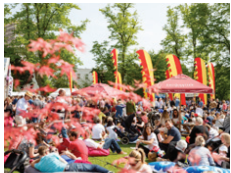
CHELTENHAM JAZZ FESTIVAL

There is a lot to do and these are challenging times; however we are committed to tapping into that interest in advancement, ambition and energy I felt in my first few days, ensuring Cheltenham Festivals continues to get better and better.