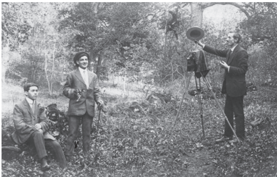
CCC OUTING TO CHEDWORTH, 1920S.

Regular club exhibitions have contributed greatly to Cheltenham's local arts scene. Back in 1896, its first major exhibition attracted 900 national as well as local entries covering "every branch of the art."