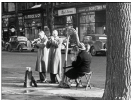
'THE SPA HARP TRIO' BETTER KNOWN AS 'THE THIRSTY THREE', THE PROMENADE, CHELTENHAM, C. 1920.

As the club looks optimistically to the future, it is interesting to reflect on the huge technological advances. In 1909, for example, members excitedly looked forward to new advances offered by colour film and slide technologies, whilst 90 years later we began a pioneering new journey into digital photography. I wonder what the