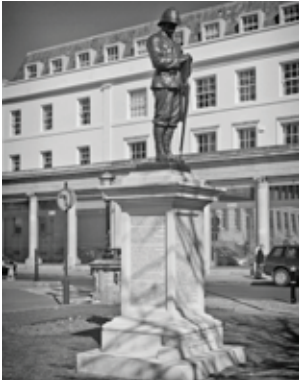
CHELTENHAM CAMERA CLUB PHOTO: SANDY FOTHERGILL