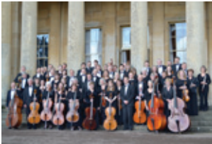
CHELTENHAM SYMPHONY ORCHESTRA, SEE LISTINGS