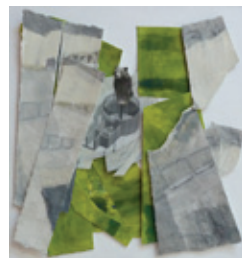
LINDA DAVIES AT GROUP EXHIBITION GARDENS GALLERY, 8 - 14 APRIL

Nicki Gwynn-Jones Wed 27 May - Tue 2 Jun, fine art photography.