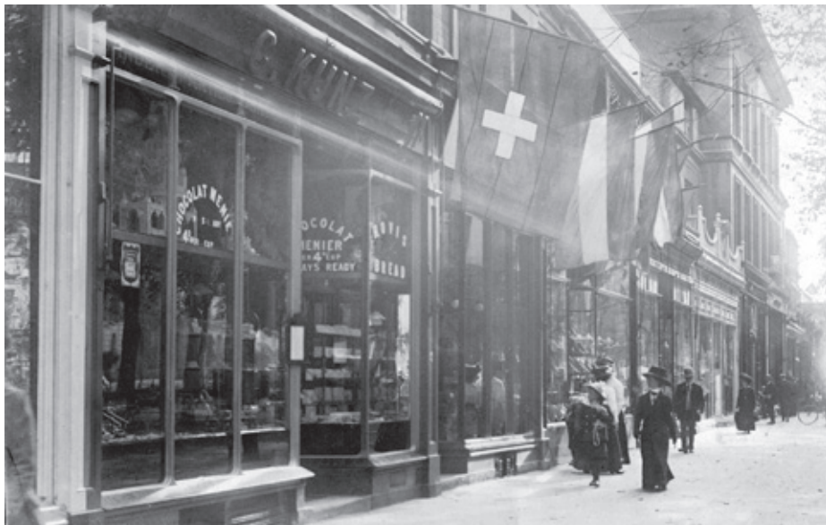
KUNZ PATISSERIE, THE PROMENADE, CHELTENHAM, 1911.