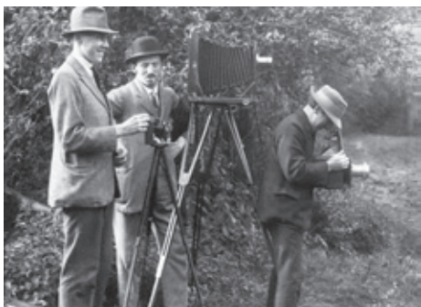
CHELTENHAM CAMERA CLUB OUTING, 1920S.

As the club looks optimistically to the future, it is interesting to reflect on the huge technological advances. In 1909, for example, members excitedly looked forward to new advances offered by colour film and slide technologies, whilst 90 years later we began a pioneering new journey into digital photography. I wonder what the