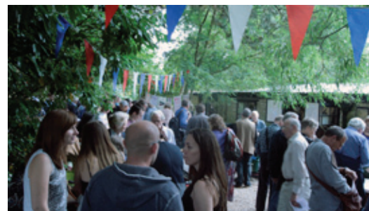
THE CHARM OF PRESSIVAL 2014 - AT THE HEART OF THE WHITTINGTON VILLAGE FAIR