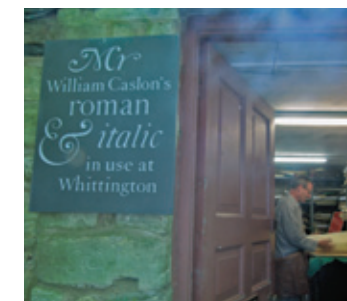
WHITTINGTON PRESS ENTRANCE