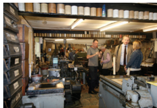
PRESSES AND MONOTYPE FOUNDRY WITHIN THE WORKS