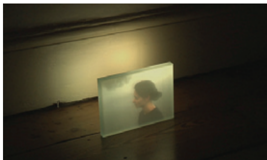
BORE SONG, DETAIL

Bore Song is a suspended vertical film loop projected onto a small chunk of float glass. At the edge of the river, a woman sings a single note at the point of the bore tide passing, her voice following the surge of water. ‘In the gesture she performs’ explains Louisa, ‘she marks my sister’s last breath and my own attempt to throw my grief into the river. The tide carrying