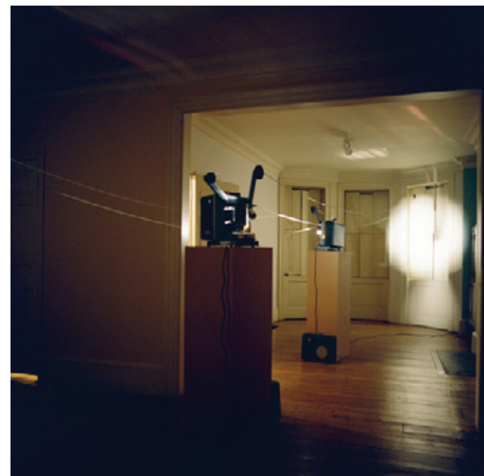
SONG OF GRIEF, INSTALLATION AT DANIELLE ARNAUD, 2011

This piece was first show at Darbyshire Award at Museum in the Park, Stroud in 2009.