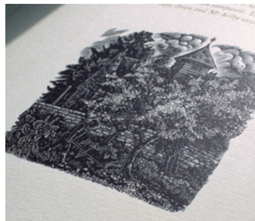
WOODCUT ILLUSTRATION PICTURED WITH HAND-SET TYPE IN AN EXCERPT FROM HER SERIES ON THE VILLAGE OF WHITTINGTON, AND WEEPING CHERRY, REPRODUCED IN MIDWINTER, BOTH CARVED BY MIRIAM MACGREGOR

of the Whittington Press, even the type characters themselves are artistically subtle objects and those in the know will be excited to learn that they are casting up some of their rarer type for sale, and, Stop Press: At the time of writing have available Caslon in 18-, 22-, and 24-point, roman, italic and small caps. Centaur will be next on the list.