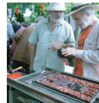
WOOD TYPE USED IN A COMMEMORATIVE PRINT ON THE DAY BY DENNIS GOULD

FOR MORE INFORMATION ON THE PRESS VISIT WWW.WHITTINGTONPRESS.COM