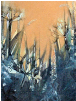
ROSIE LOMBERG, GARDENS GALLERY 29 OCT – 4 NOV

Stunning Landscape Pictures: Colin Prior , Thu 27 Nov, 7.30pm, £12, Pittville Pump Room, Cheltenham Camera Club hosts. Widescreen images and photo tips.